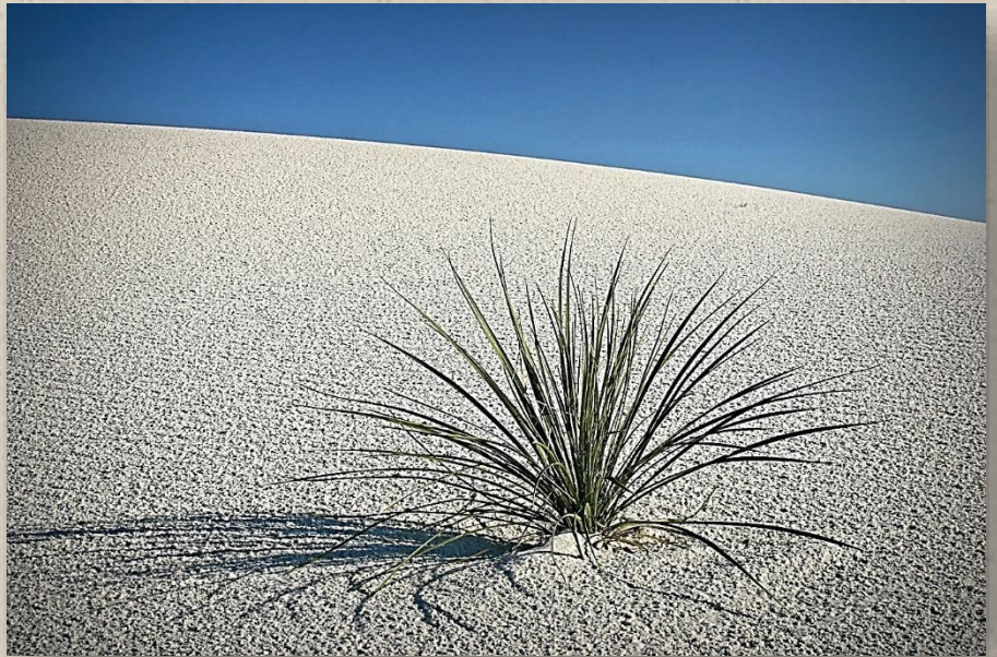
Desert Wonder – Flowers and Plants 1 st place