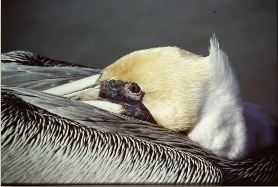
All Tucked In – Animals 1 st place