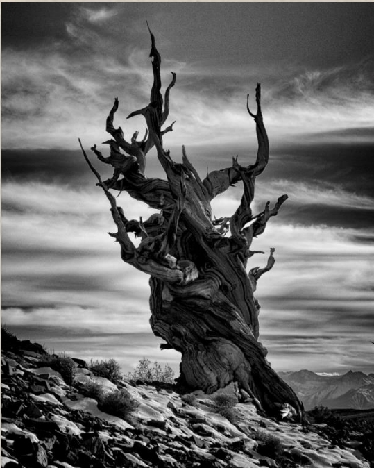
Bristlecone Stands Alone – Landscapes 2 nd place