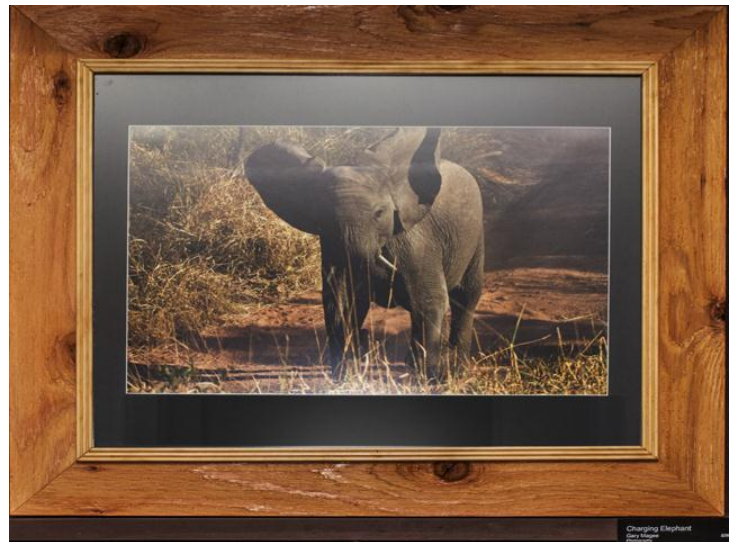
Charging Elephant Photography