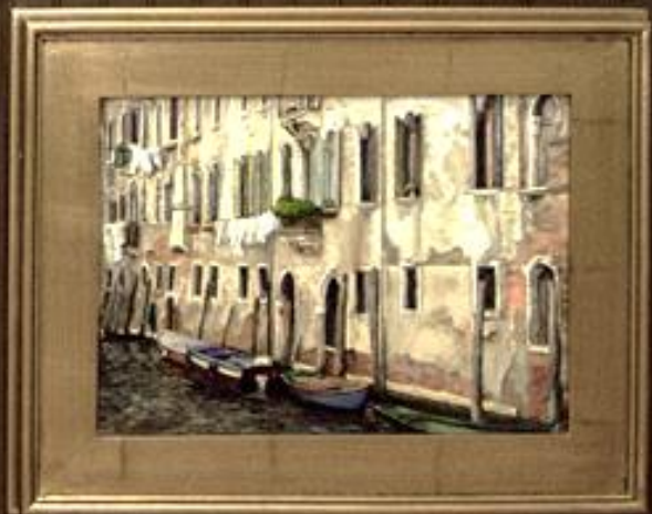
A Canal in Venice 1900