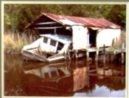
My Old Boat 1900