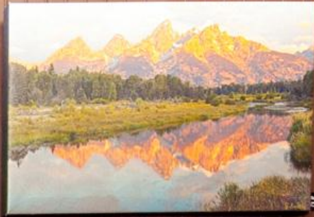
Grand Teton 1900