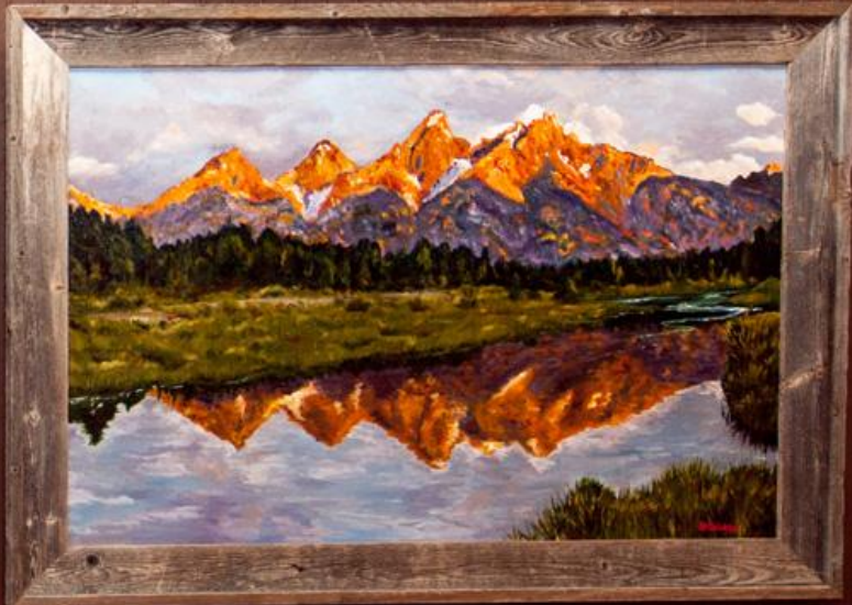
The Grand Teton in Spring 1900