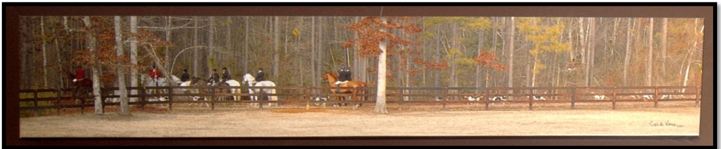
Catch the Moment $100