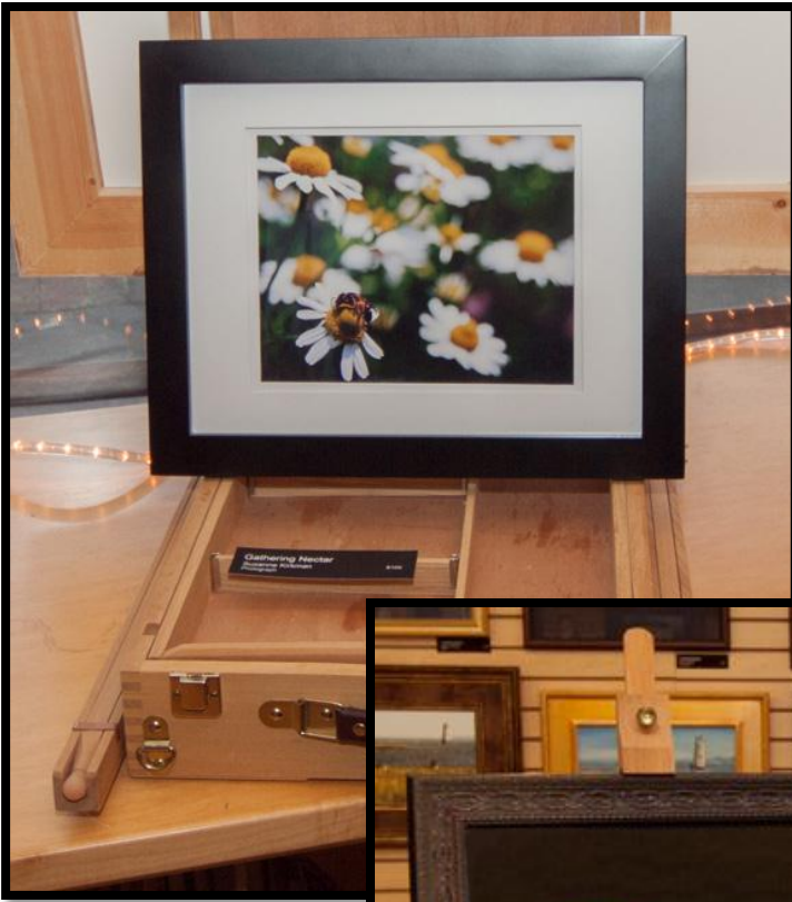
Gathering Honey Photograph $100