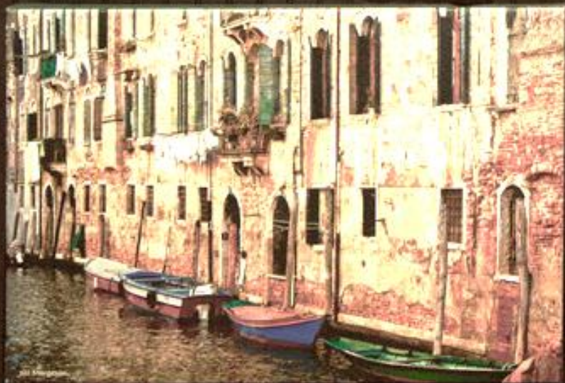
A Canal in Venice 1900