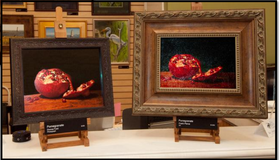
Pomegranate Danae Papp Photograph $100