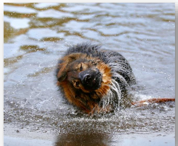
2nd HM - Kathryn Saunders - Shake, Shake, Shake