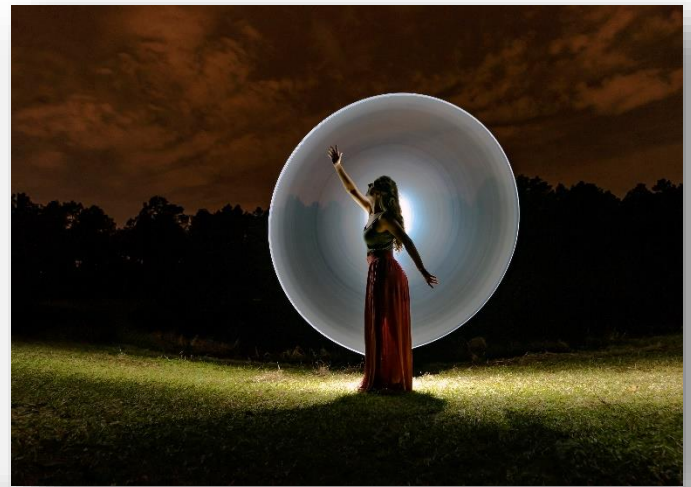
2nd Place - Math Smith - Portal