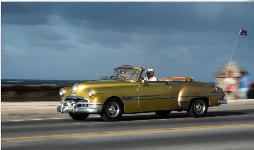
3rd Place - Pat Anderson - Zoom Zoom