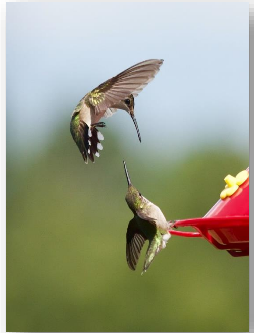
2nd Place - Kathryn Saunders - Hummingbirds