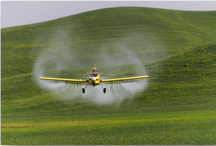
1st Place - Joe Owen - Coming At You