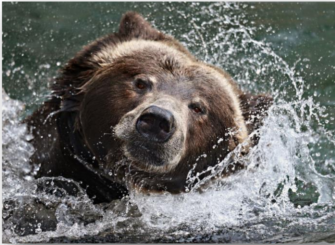
1st Place - Donna Ford - Splish Splash