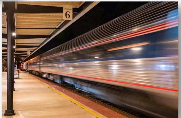
3rd Place - Jim Davis - Silver Star