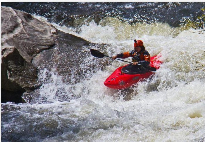
2nd HM - Bill Bower - Down the Chute