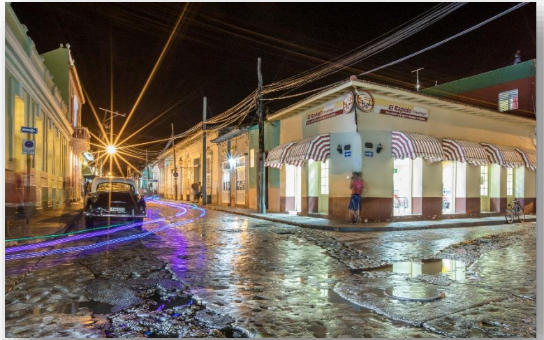
1st HM - Dale Jennings - Night Lights