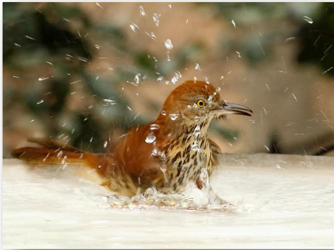
1st Place - Debra Regula - Feather Rinse Repeat