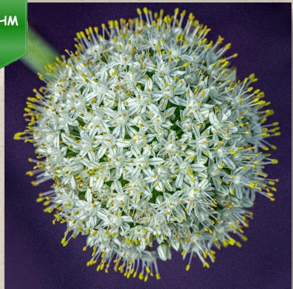
HM TIE – Neva Scheve – Onion Flower