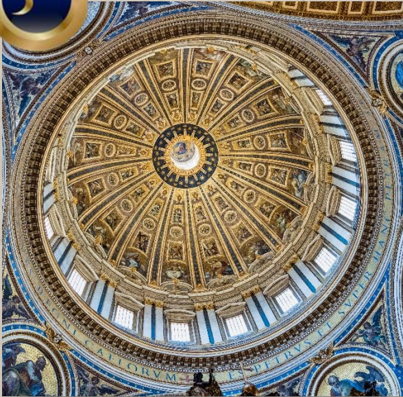
3 rd TIE – Jacques Wood Circle of Faith