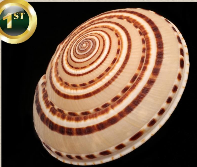
1st TIE - Donna Ford - From the Sea