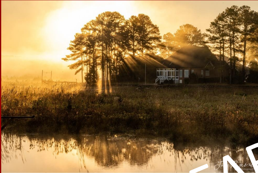
Taken out my backdoor

Throughout this year we will be Celebrating SPC and Honoring 40 Years: Looking Back, Moving Forward. Our 1 st Page will contain images, taken by our members of things both NEAR & FAR....Step out your backdoor or around the world