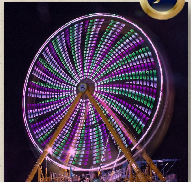
3 rd - Bill Buss Wheel