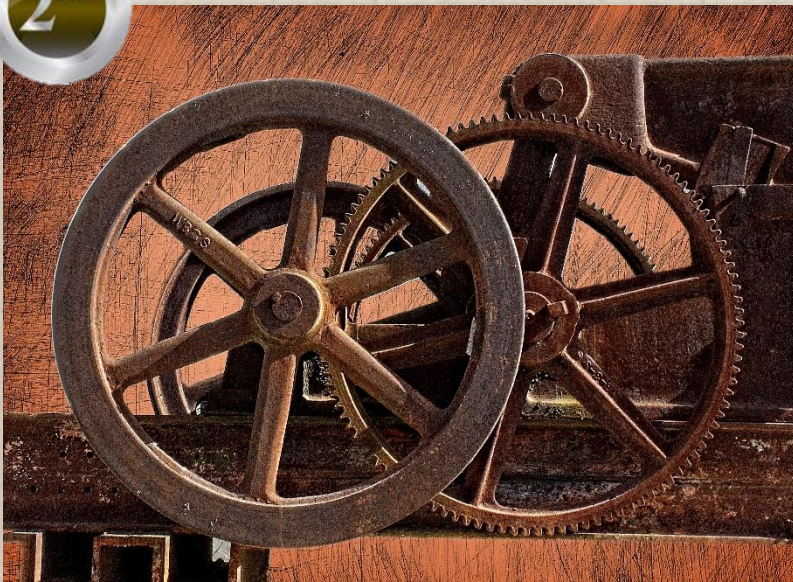
2 nd – Bill Buss Round & Round