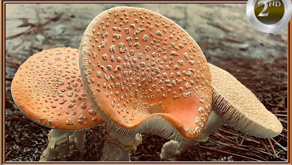
2 nd – Mary Wheaton - Mushrooms in Orange