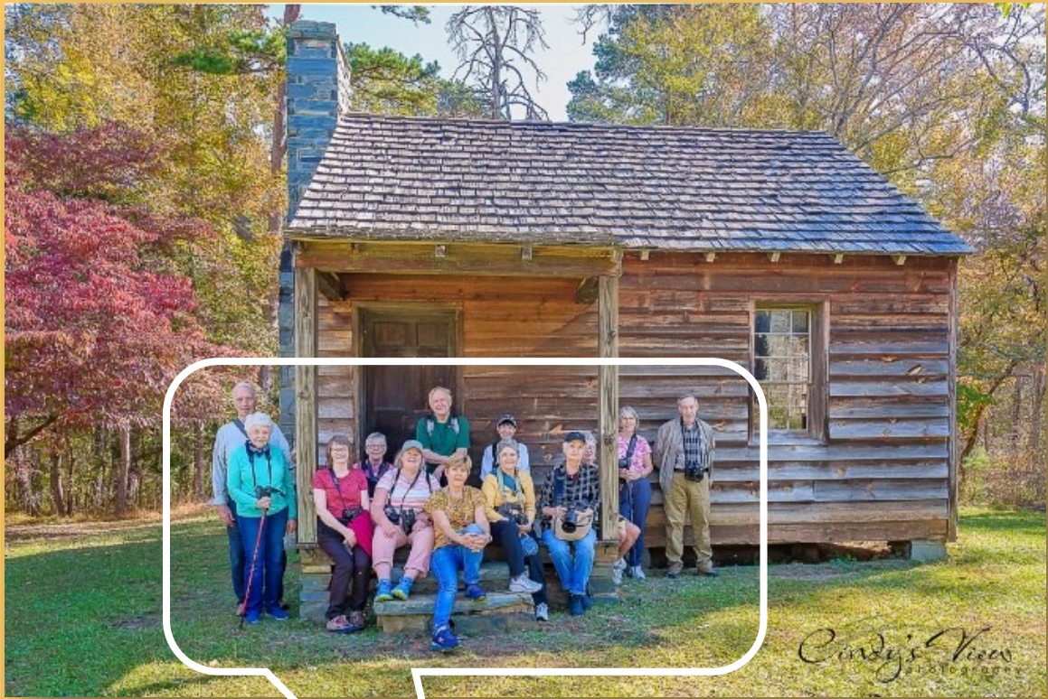
Morrow Mountain State Park