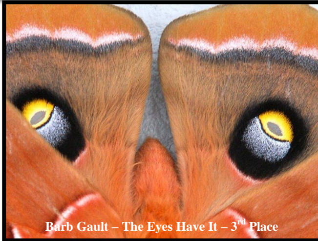
Barb Gault – The Eyes Have It – 3rd Place