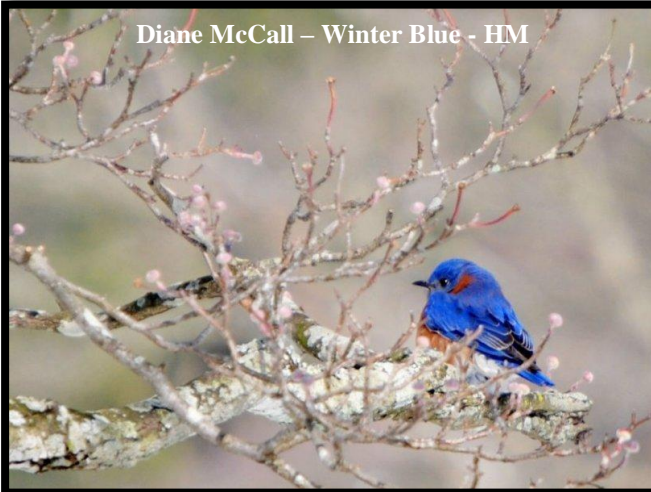
Diane McCall – Winter Blue - HM