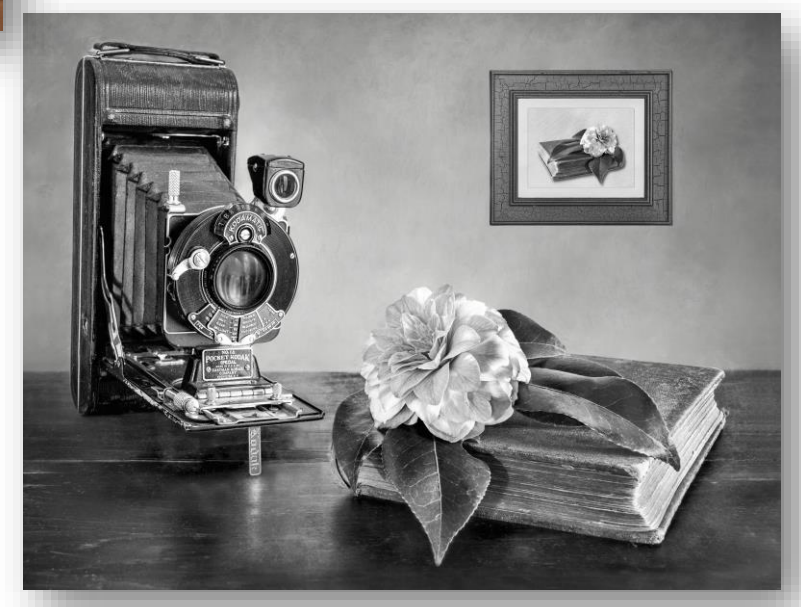
HM , Dee Williams, Image Creation