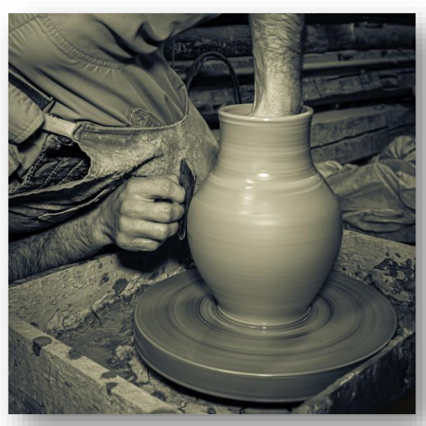
1st Place, Shari Dutton, Potter's Tool